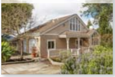
Glorietta beauty with spectacular views and large lot. Sold for $1,885,650. Represented buyers.